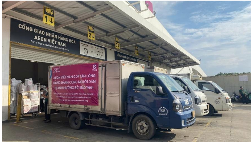
Convoys transporting essential goods from AEON Vietnam and the Ministry of Industry and Trade are providing support to Northern provinces