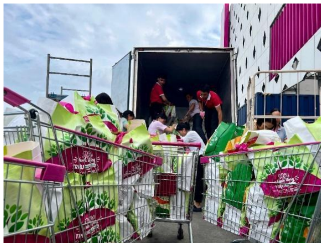
AEON People prepare goods for delivery to affected provinces