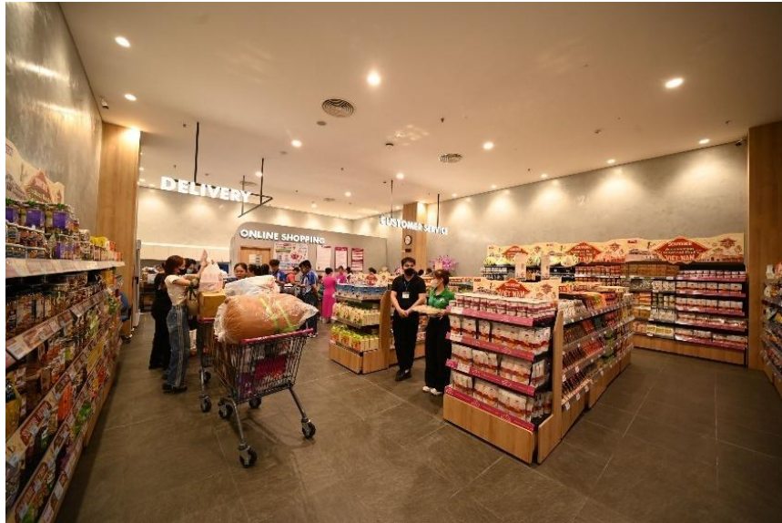
The souvenir counter is available for the first time at AEON Hue

A highlight of the first floor of AEON Hue is the Delica food court, the largest in Hue. This 1,200 square meter space offers a diverse culinary experience with over 500 dishes, from traditional Japanese fare like sushi and tempura to Vietnamese favorites, all served in a 300-seat dining area