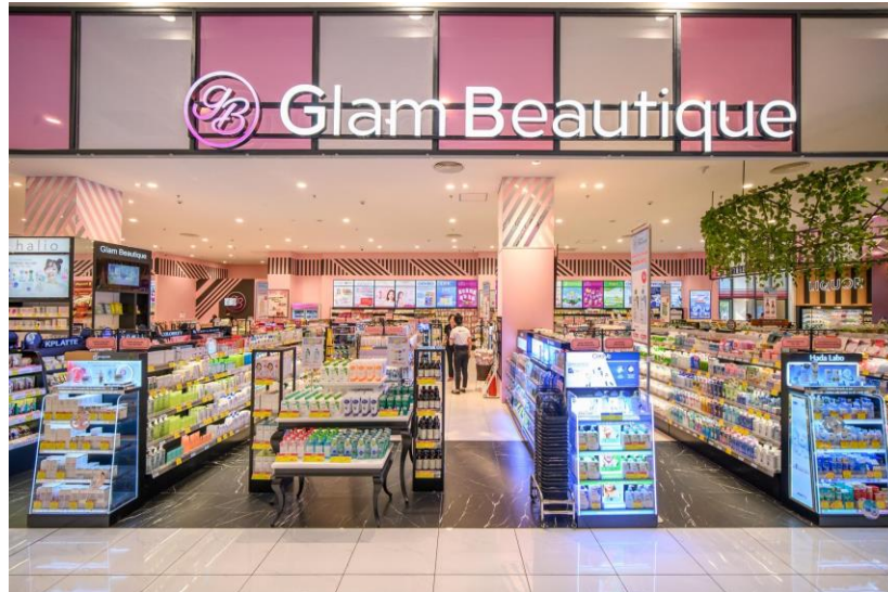
Glam Beautique - A paradise for shopping health and beauty products