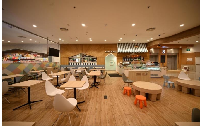
A large, relaxing play area for children is available at AEON Hue

To enrich the lives of Hue residents, AEON Hue also introduces a range of high-quality Japanese products and services exclusively available at AEON. Products from private brands such as TOPVALU, HOME COORDY, and MY CLOSET, along with specialty stores like Glam Beautique and AEON Bike, cater to specific customer needs, enhancing their overall shopping experience for a more fulfilling life.