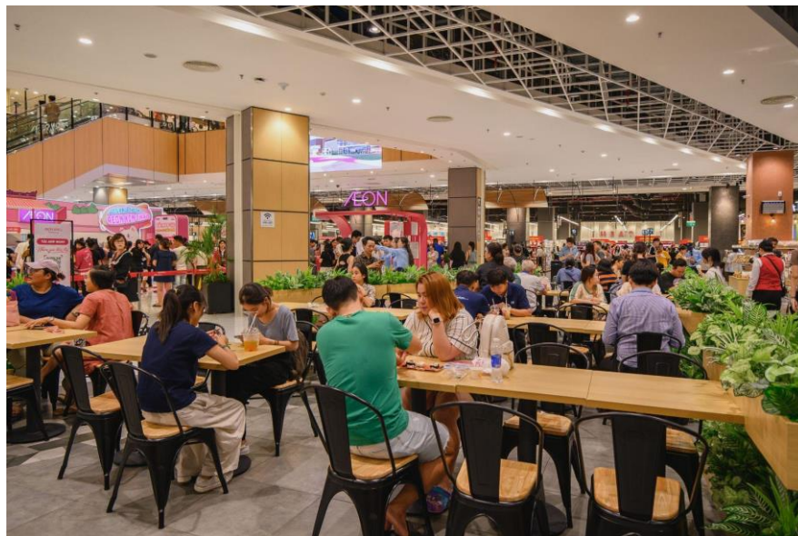
The food court is always a major attraction for customers visiting AEON

A highlight of the first floor of AEON Hue is the Delica food court, the largest in Hue. This 1,200 square meter space offers a diverse culinary experience with over 500 dishes, from traditional Japanese fare like sushi and tempura to Vietnamese favorites, all served in a 300-seat dining area