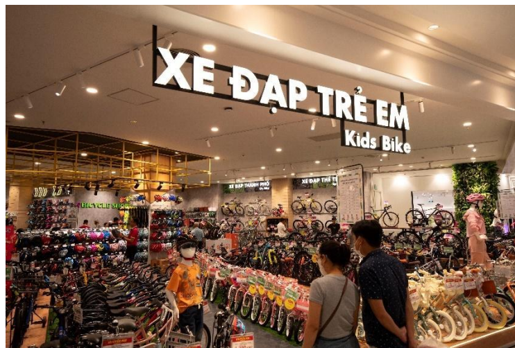
The 'AEON BICYCLE' area offers a wide variety of bicycle models and provides in-home maintenance services

In addition to offering high-quality products, AEON Hue provides a range of services and amenities such as a children's play area, free delivery, complimentary gift wrapping, and VAT refunds, along with exclusive offers for members. These offerings not only cater to shopping needs but also provide convenient and enjoyable experiences.