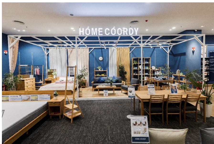
Hóme Cóordy area provides furniture with Japanese quality

HÓME COÓRDY is AEON's lifestyle brand, which aims to offer a comfortable and enriched customers' life through a diverse selection of furniture and interior products, including items for bedding, towels, dining and kitchen, and laundry. With an area of 450m 2 , HÓME COÓRDY area at AEON Ta Quang Buu is designed to provide a wide range of high-quality products characterized by their trusted quality and timeless, yet simple design, making them versatile enough to harmonize with any home décor.