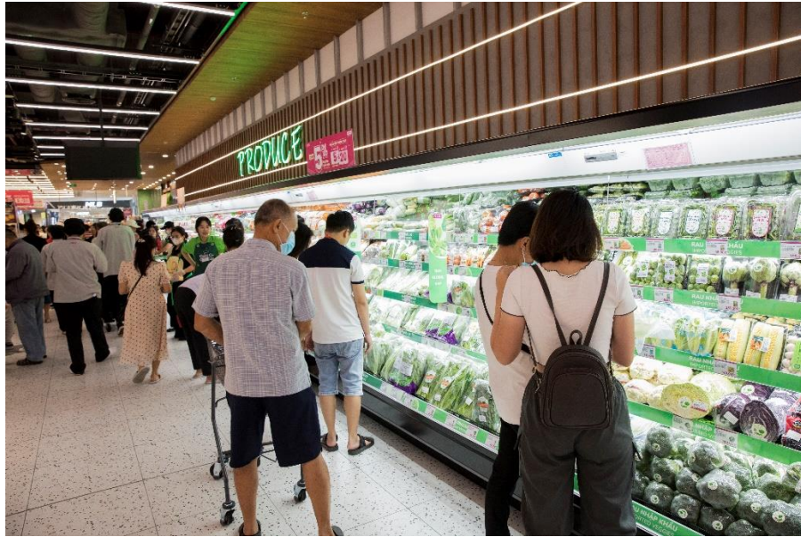
Customers go shopping at supermarket area, AEON Ta Quang Buu on the opening day

Additionally, AEON Ta Quang Buu provides a range of ready-to-eat (RTE) and ready-to-cook (RTC) products, making meal preparation quick and easy for a more modern and convenient lifestyle. Key products include a variety of sauces which are perfect for a ready-to-cook lifestyle and healthy oils.