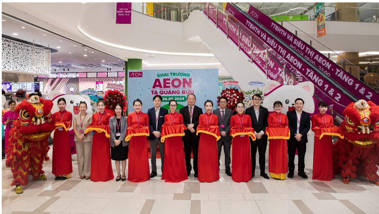
AEON Ta Quang Buu officially opens on 26 Sep 2024

On 26 Sep 2024, AEON Vietnam Co., Ltd (hereafter referred to as AEON Vietnam) opens AEON Ta Quang Buu, its 8 th General Merchandise Store (GMS). In the media conference on the same day, AEON Vietnam's representative shares that this is under AEON's strategy to expand in Vietnam with multi retail formats to meet the need of Vietnamese customers.