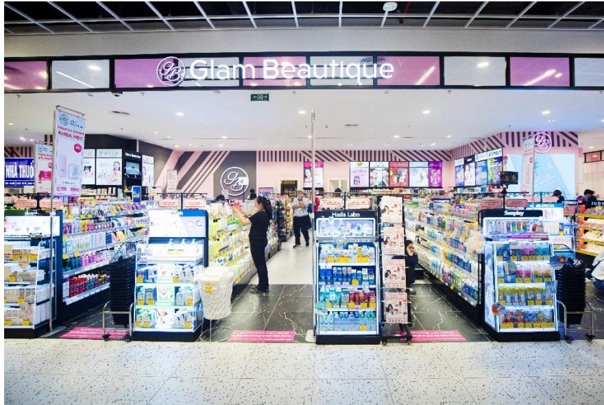
Glam Beautique – a world of health and beauty care products

Glam Beautique is a health and beauty haven offering a wide range of products and services. With a focus on "Kawaii" aesthetics, the store provides genuine Japanese and natural skincare, branded cosmetics, and accessories. Beyond products, Glam Beautique offers personalized skin analysis, rejuvenating spa treatments (open from Nov 2024), and health check stations.