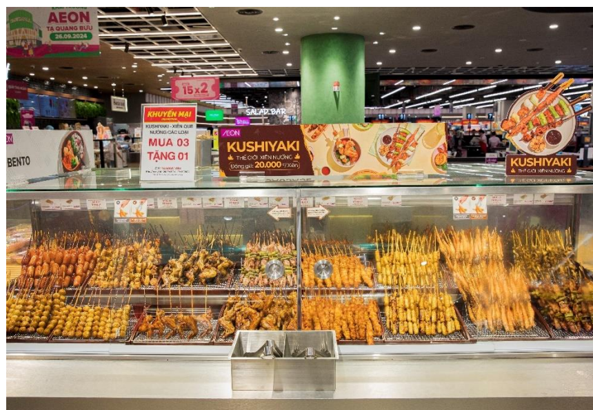
New products – Kushi-yaki at AEON Ta Quang Buu, which brings new experiences to customers

The Delica area at AEON Ta Quang Buu spans a total area of 612 m 2 with 160 seats and is designed to meet the needs of customers of all generations. There are a variety of new products, including KUSHIYAKI - world of skewers with a diverse menu of sauces such as Shio, Teriyaki, and BBQ, new assortments of sushi, including inari and aburi, as well as fresh sashimi. AEON Bakery introduces new cuisine trends for customers, featuring flat croissants, cream puffs (choux cream), and a variety of tarts including cheese, egg, tiramisu, and fruit tarts.